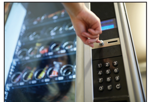
Get a snack