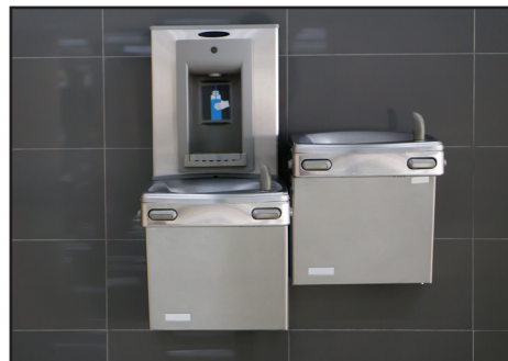
Get a drink