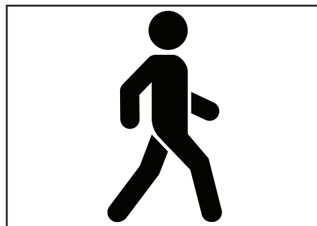
Take a walk