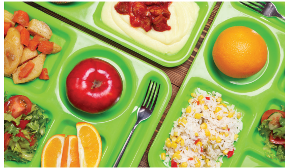
Lunch with a Staff