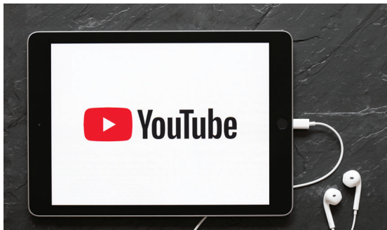
5 minutes on YouTube