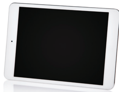
5 min to Play Game on iPad