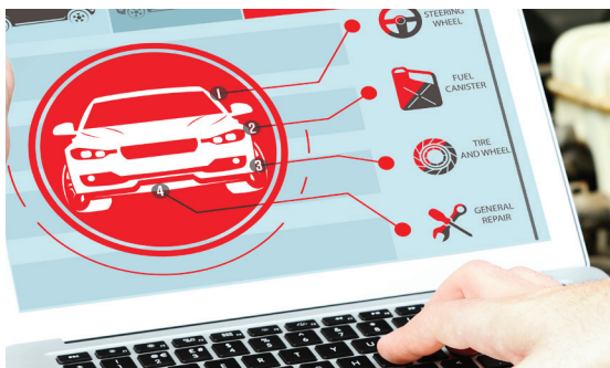
5 min to Search Car Facts