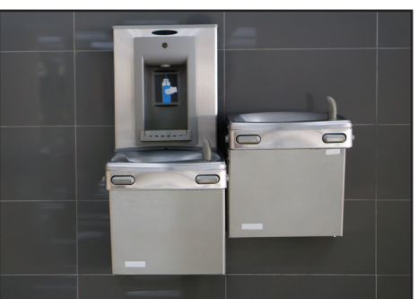
Get a drink