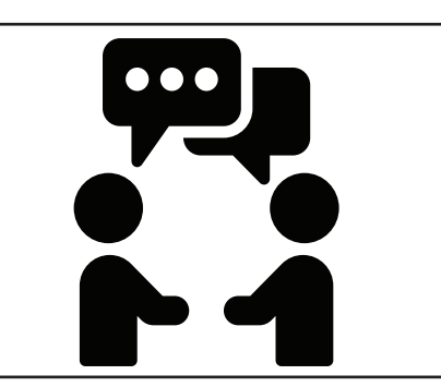
Talk to a friend