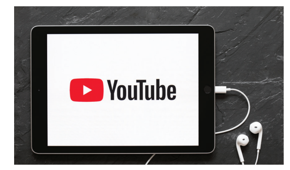
5 minutes on YouTube