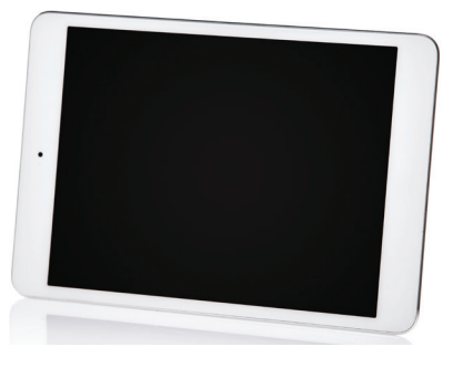
5 min to Play Game on iPad