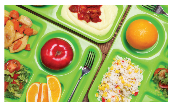
Lunch with a Staff