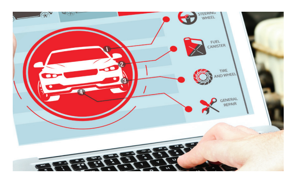
5 min to Search Car Facts