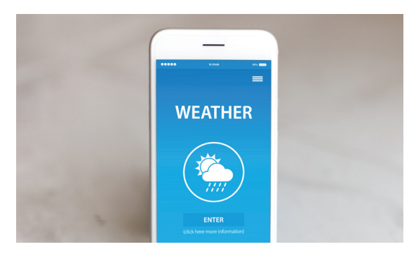
5 minutes on Weather App

CRITERIA FOR REINFORCEMENT: Once student has received 10 "yesses" on the appropriate responses/ apologies data sheets. They can select 1 activity from the reinforcement board. Student should be given access to the activity immediately after earning the 10th "yes."